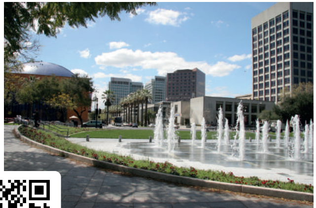
Silicon Valley, CA